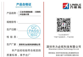
Certificate of conformity *1