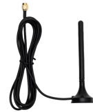
2 m suction cup antenna -4G (Optional cabinet antenna, rubber stick antenna, etc.)