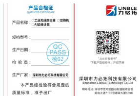
Certificate of conformity *1