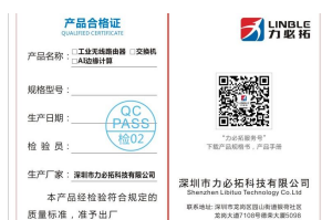
Certificate of conformity *1