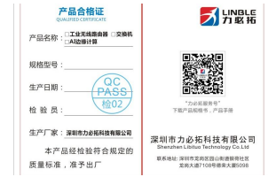
Certificate of conformity *1