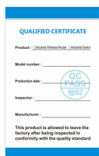
Certificate of conformity *1