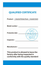
Certificate of conformity *1