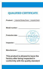
Certificate of conformity *1