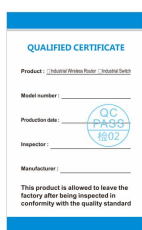
Certificate of conformity *1