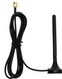
2 m suction cup antenna -4G (Optional cabinet antenna, rubber stick antenna, etc.)