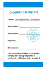
Certificate of conformity *1