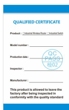
Certificate of conformity *1