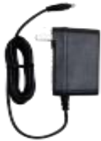
Power adapter *1 Optional: British Standard / European Standard / American Standard