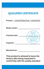
Certificate of conformity *1