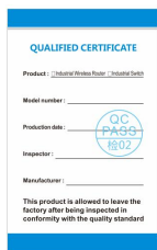
Certificate of conformity *1